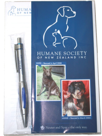
Humane Society Pen $2