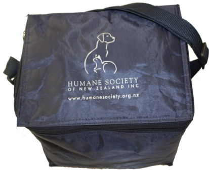
Keep your Drinks Cool $10

Orders should be sent to: Humane Society, PO Box 29060, Auckland 1344