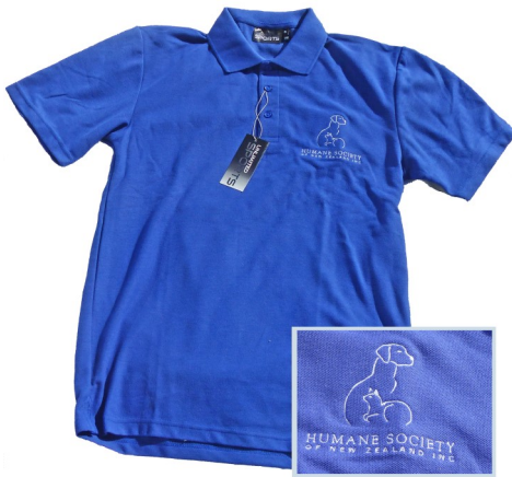
A T-shirt $30