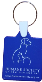
Humane Society Key Ring $2