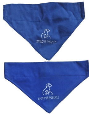
A Bandana for your dog Small or Large $10